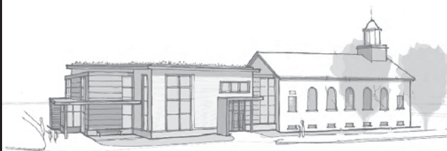
VIEW FROM BALL FIELDS